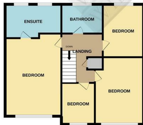
TOTAL FLOOR AREA : 1698 sq.ft. (157.8 sq.m.) approx.

Whilst every attempt has been made to ensure the accuracy of the floorplan contained here, measurements of doors, windows, rooms and any other items are approximate and no responsibility is taken for any error, omission or mis-statement. This plan is for illustrative purposes only and should be used as such by any prospective purchaser. The services, systems and appliances shown have not been tested and no guarantee as to their operability or efficiency can be given.